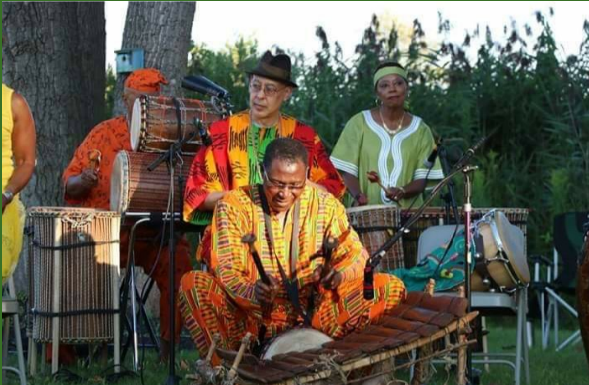
Sankofa African Drum and Dance Ensemble

‘Unity and Equality expressed by Mother Earth through African Drum and Dance’