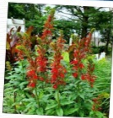
Native Garden, Gibbstown