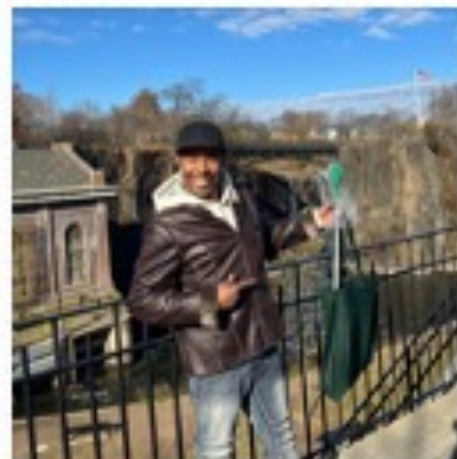
Stormwater Stories, Paterson Falls