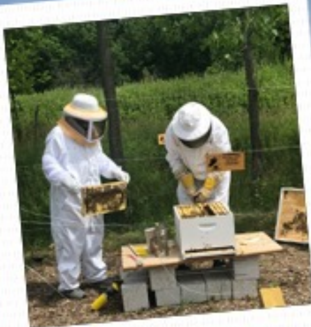
Pollinator Garden, West Orange