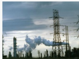
10 Air Quality