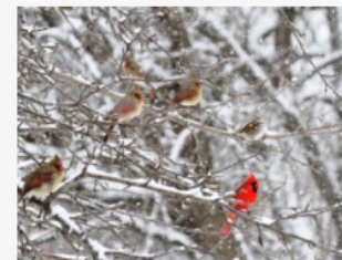
11 Climate and Climate Change