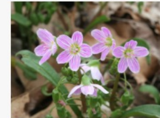
6 Flora and Fauna