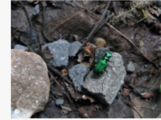
3 Geology and Soils