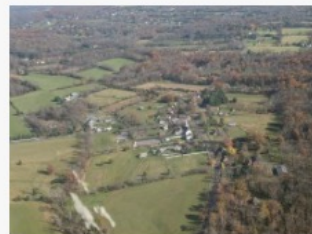
7 Land Use, Open Space, and Zoning