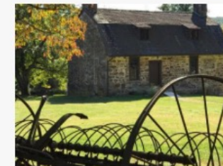
9 Historic and Cultural Resources