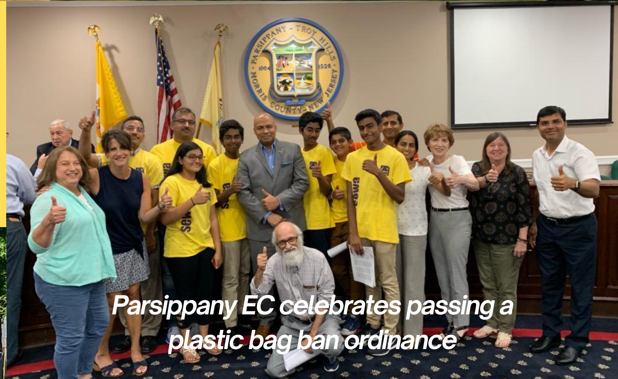
Parsippany EC celebrates passing a plastic bag ban ordinance

Comprised of dedicated, passionate and knowledgeable volunteers appointed by the mayor, ECs engage in environmental initiatives and projects that benefit their municipalities with immeasurable impact.