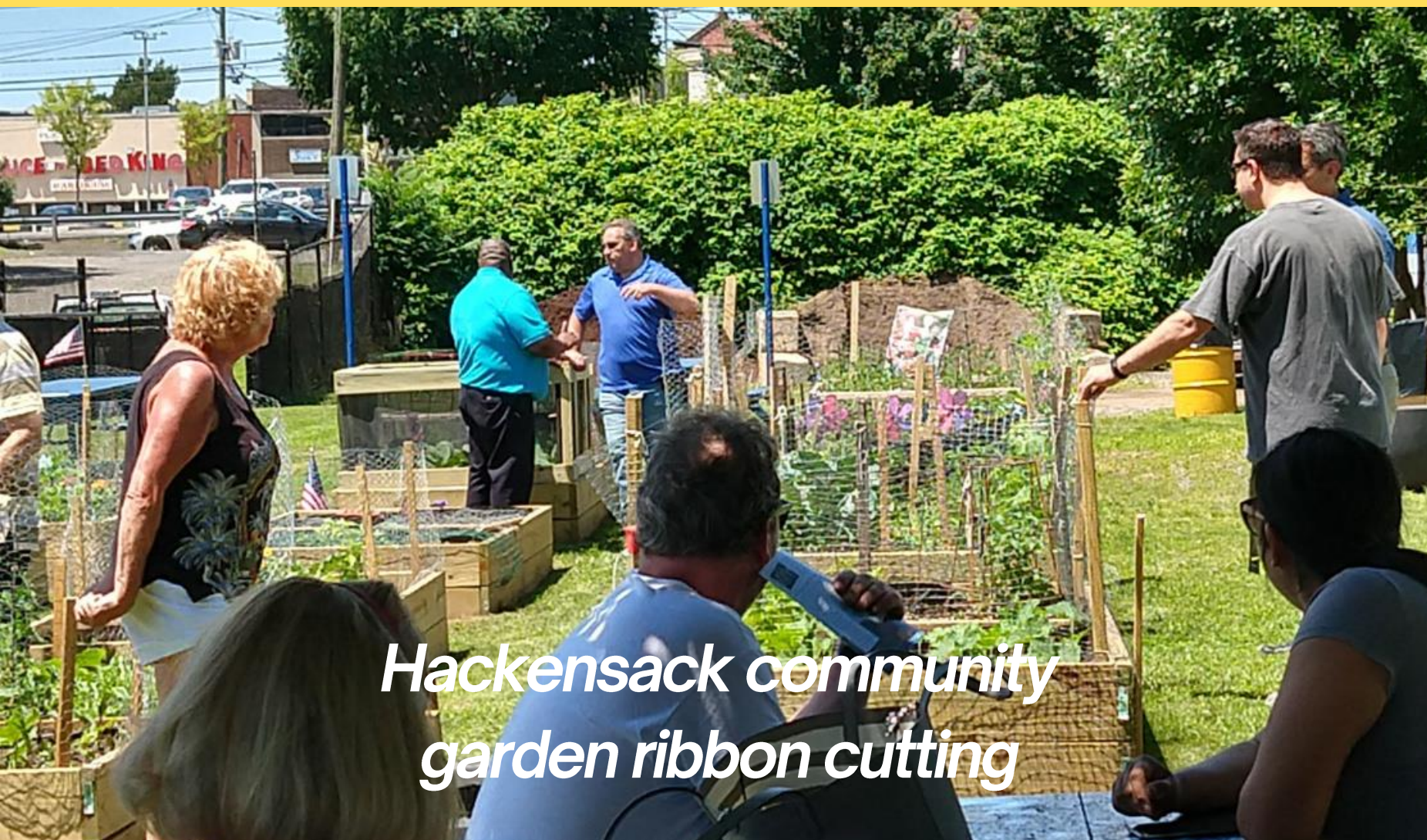
Hackensack community garden ribbon cutting

Hundreds of Environmental Commissions (ECs) across New Jersey are taking local action to protect and restore the state's natural resources and to ensure healthy communities for today and the future.