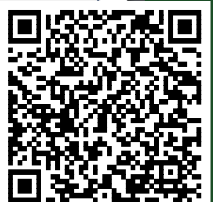
Princeton volunteer form

Scan the QR codes to access these examples