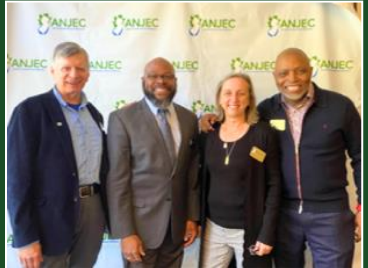
Members of ANJEC's Board of Trustees

To promote local action to protect and restore New Jersey's natural resources and ensure equitable, healthy communities . ANJEC advances its mission by engaging in diverse and inclusive practices through leadership, partnerships, education, advocacy for strong public policy and support of environmental commissions, public officials, and communities throughout New Jersey.