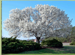
Flowering Dogwood ( Cornus florida )