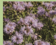
Beebalm ( Monarda fistulosa )