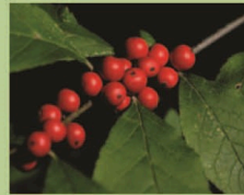
Winterberry Holly ( Ilex verticillata )