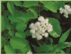
Arrowwood ( Viburnum dentatum )