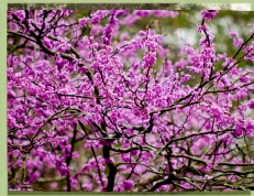
Redbud ( Cercis canadensis )