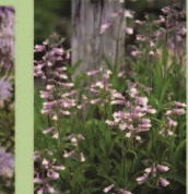
Beardtongue ( Penstemon hirsutus )