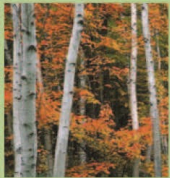
Birch ( Betula )