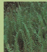
Christmas Fern ( Polystichum acrostichoides )

Some exotic plants have the same common names as native plants. When shopping, check the scientific names of the plants to ensure that they are the native variety before you make your purchase!