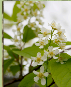
Serviceberry ( Amelanchier )